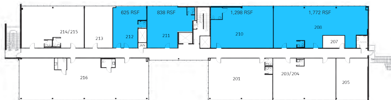
22330 - 2ND FLOOR