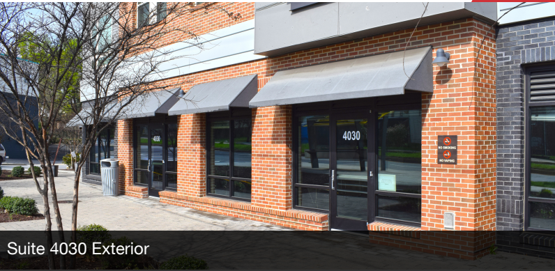
Suite 4030 Exterior