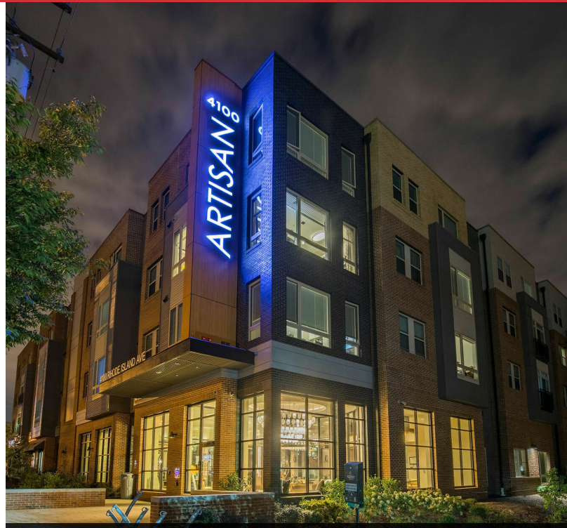
Artisan 4100