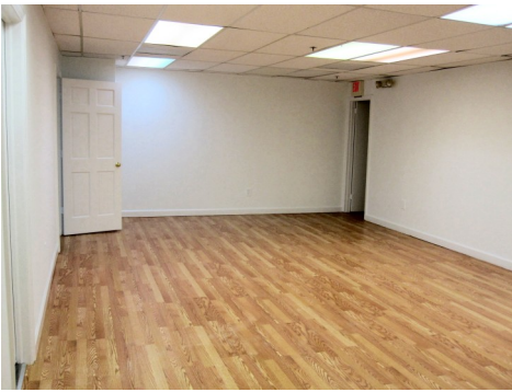
Large open area.