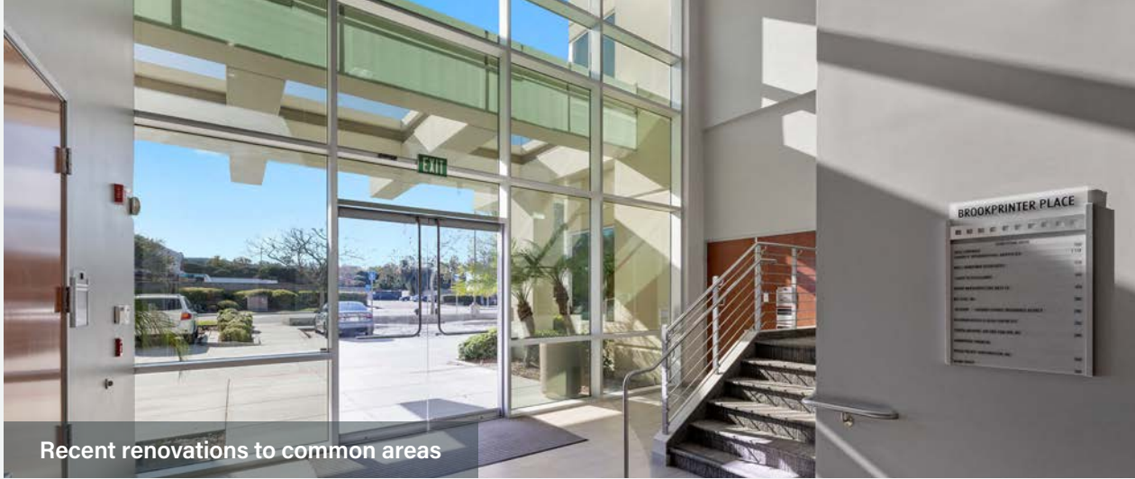
Recent renovations to common areas