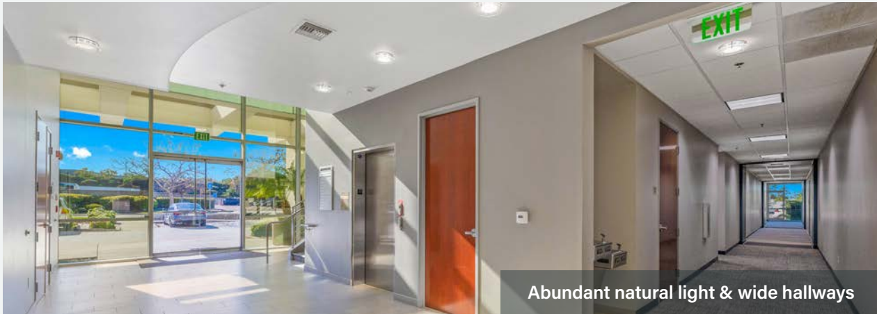
Abundant natural light & wide hallways