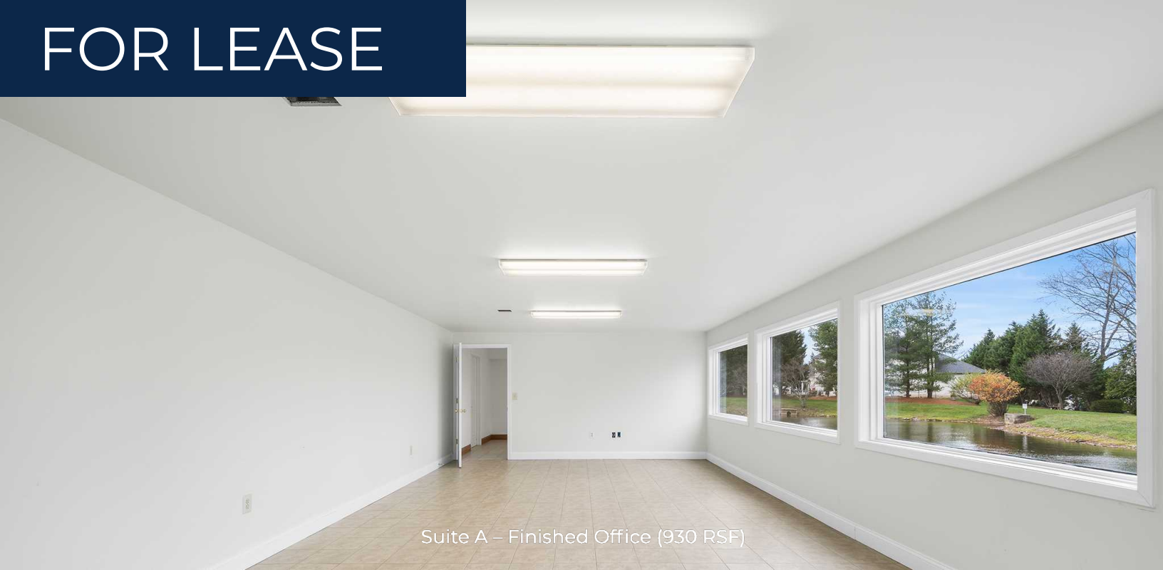
Suite A – Finished Office (930 RSF)