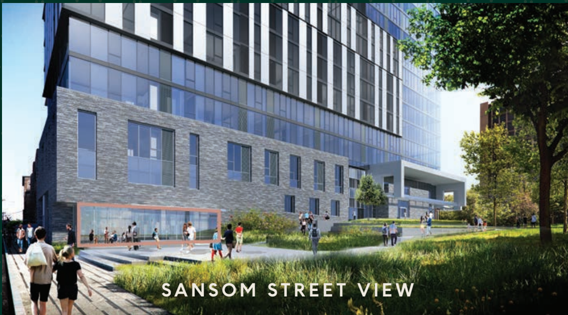
SANSOM STREET VIEW