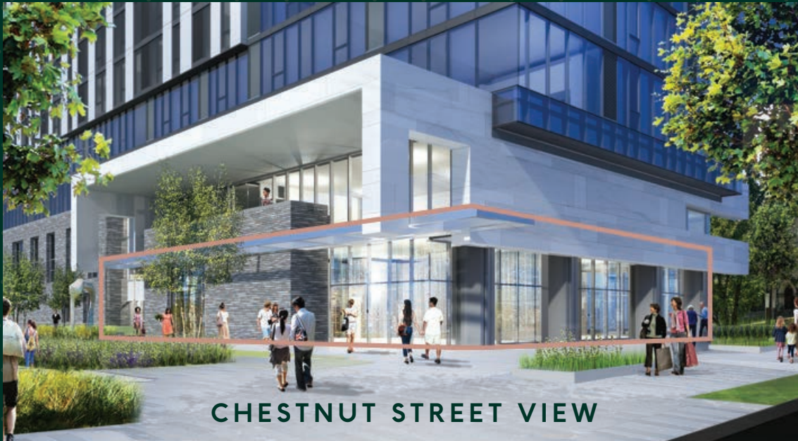
CHESTNUT STREET VIEW