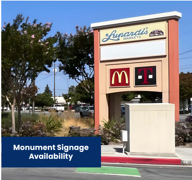
Monument Signage Availability