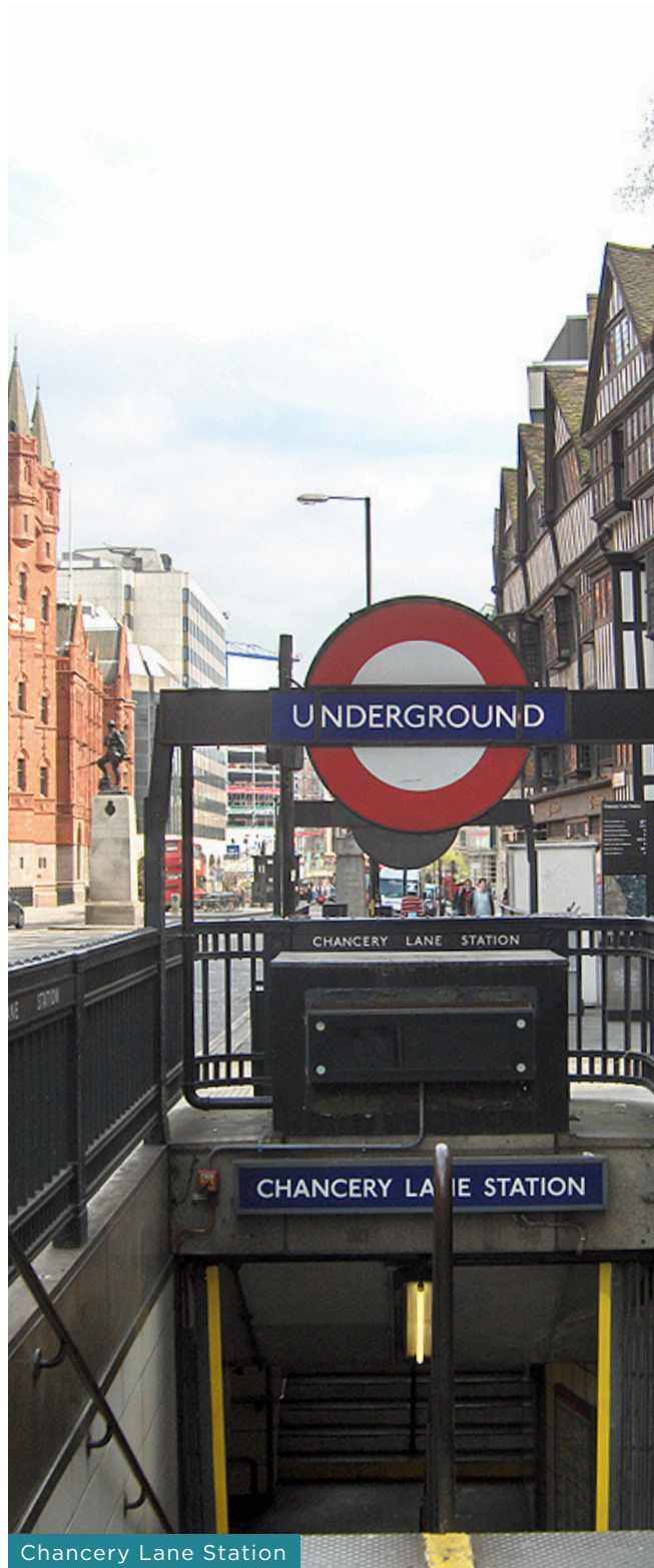
Chancery Lane Station

A valid EPC for this property can be made available upon request.