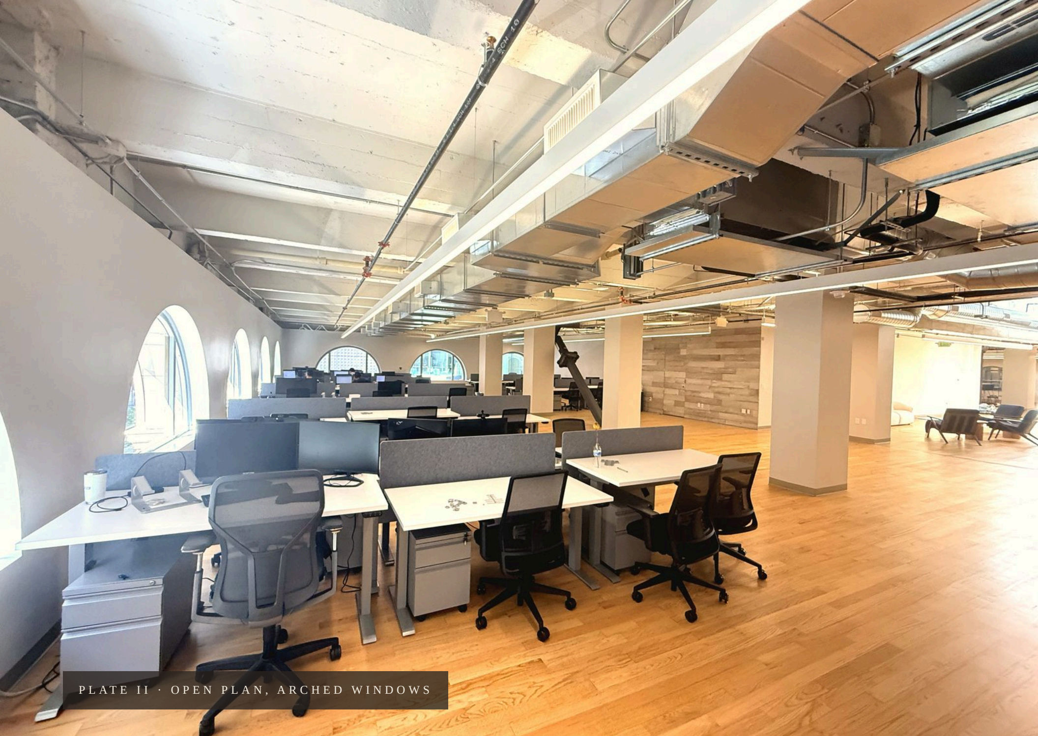
PLATE II · OPEN PLAN, ARCHED WINDOWS