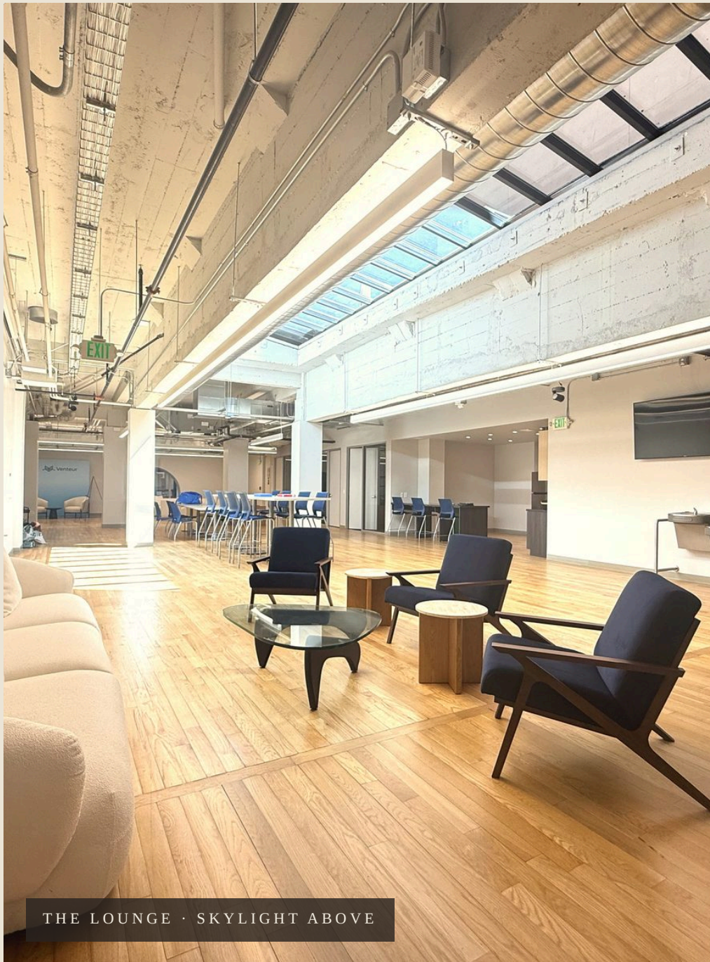
THE LOUNGE · SKYLIGHT ABOVE