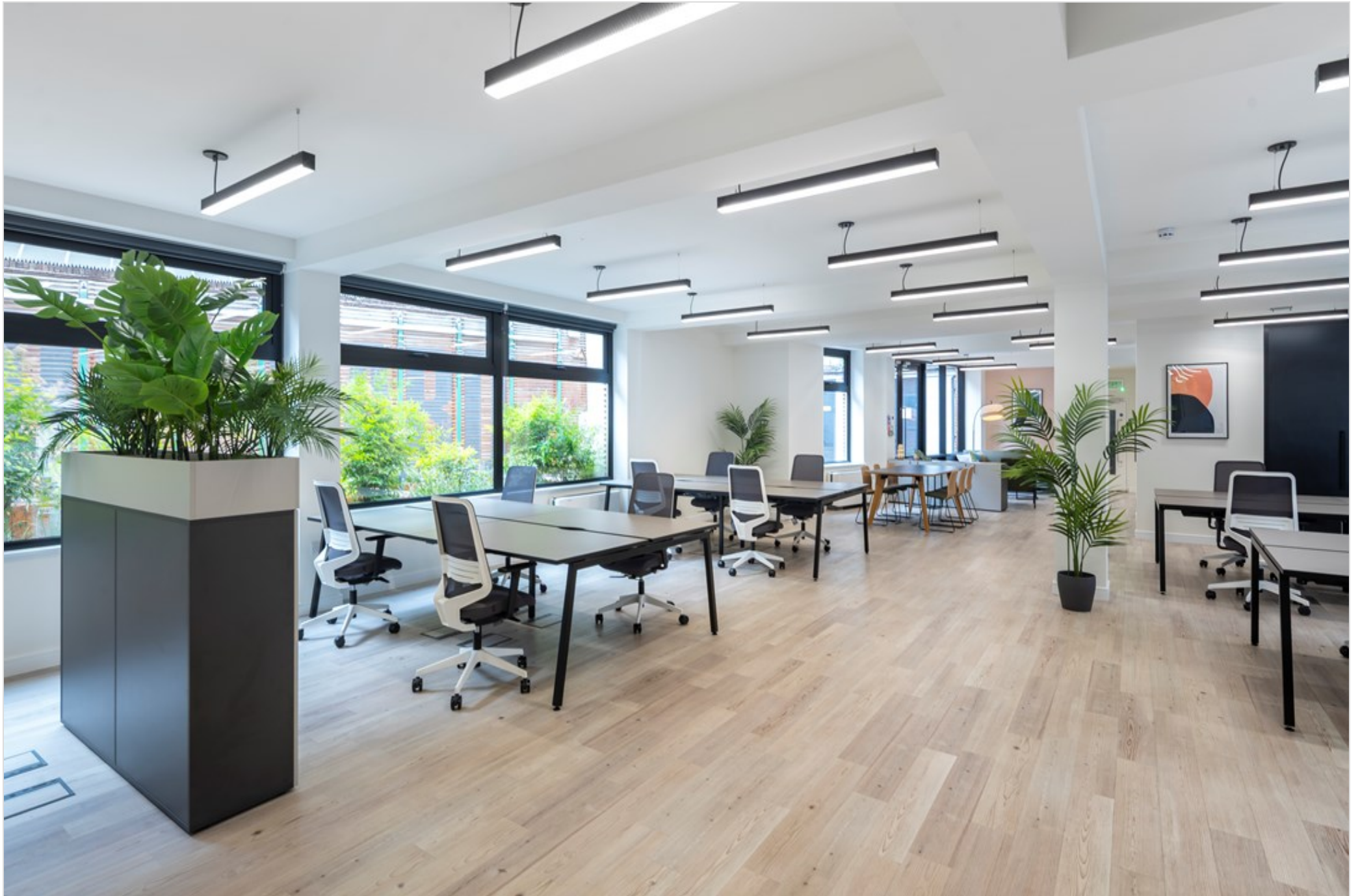
4-8 White's Grounds, London, SE1 3LA