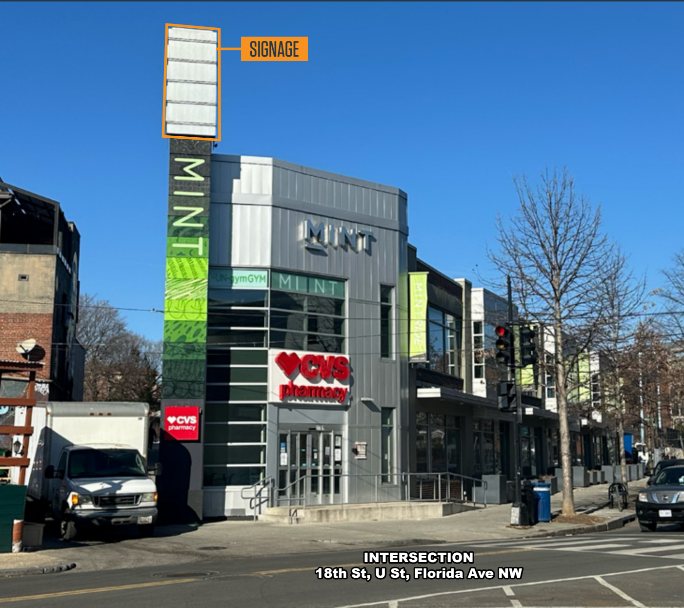
INTERSECTION 18th St, U St, Florida Ave NW