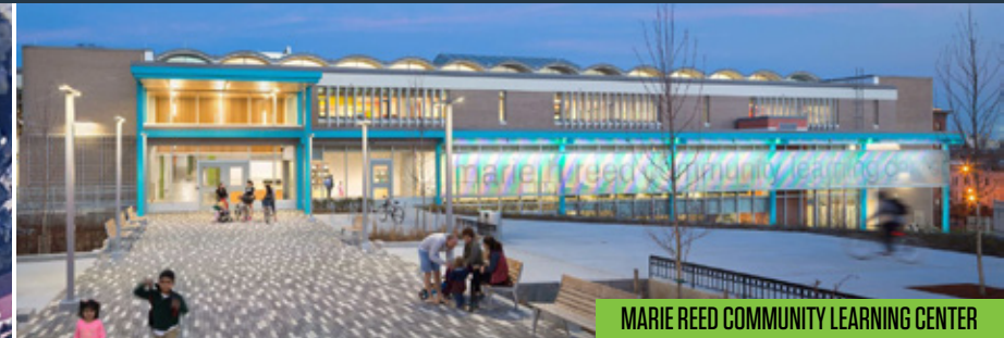
MARIE REED COMMUNITY LEARNING CENTER