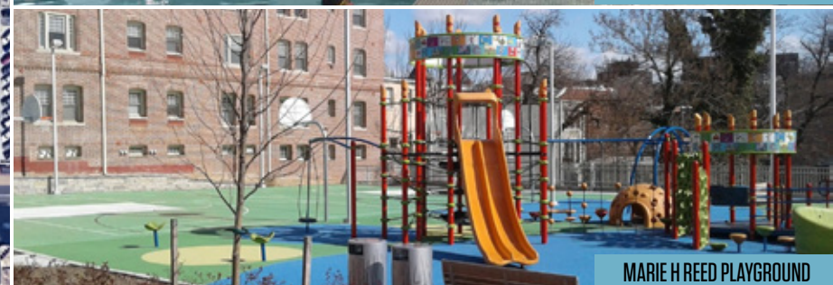
MARIE H REED PLAYGROUND