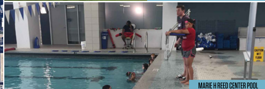
MARIE H REED CENTER POOL