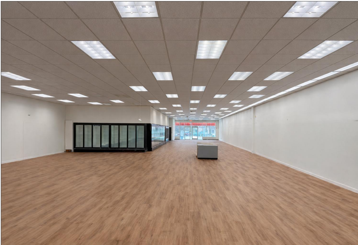
AI generated LVP flooring