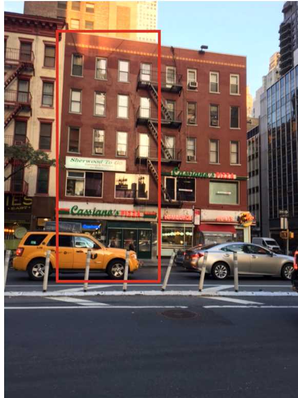
GROUND FLOOR SPACE ALONG 3RD AVE

JPB Enterprises Inc. ~ JPB Realty, Inc. 49-39 Van Dam St. Long Island City, NY 11101