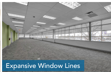
Expansive Window Lines