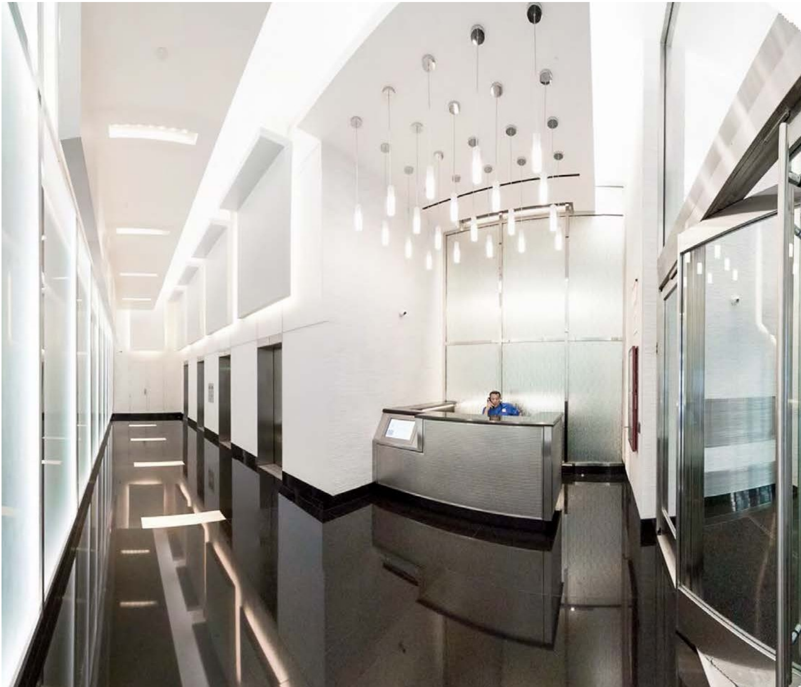
Brand new renovated lobby Upgraded elevators (4 passenger, 2 freight) 24/7 attended lobby