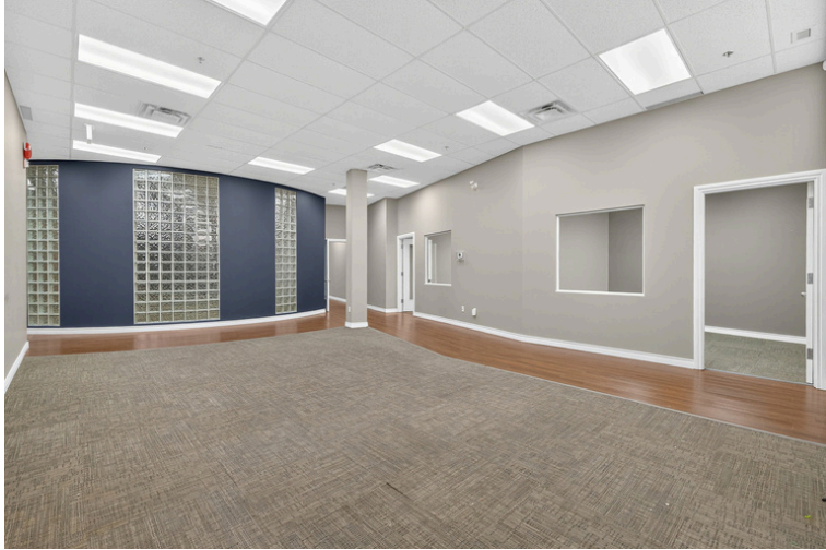
Large Flex/ Co-Working Space