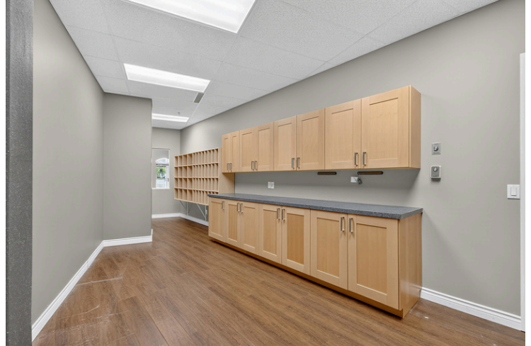
Printer & Storage Room