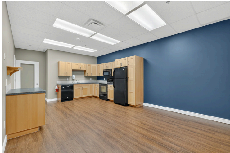
Large Kitchen & Staff Room