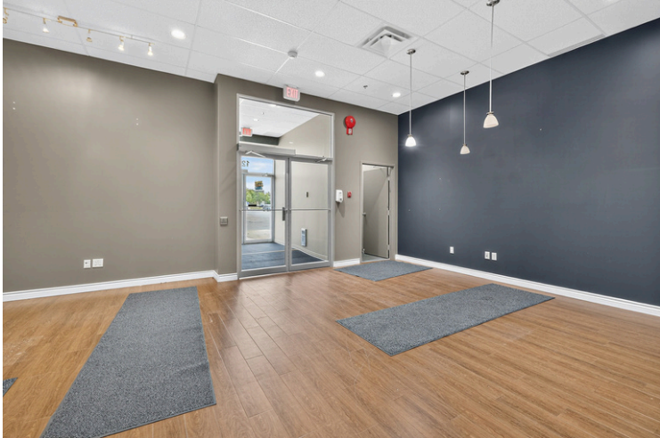
Open Reception Area