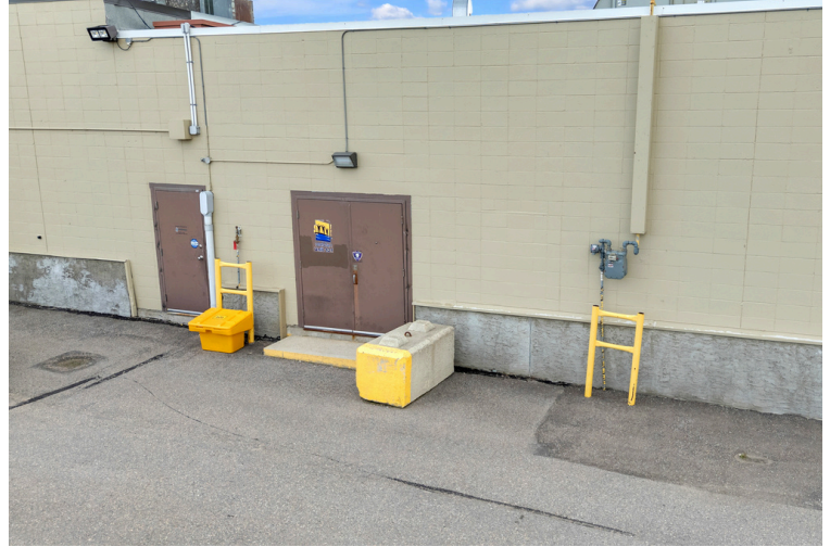
Rear Loading Access