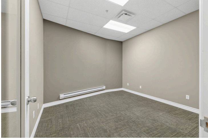
Large, Professional Offices