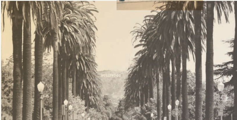
Clockwise from top left: Getty House / Los Angeles Herald Examiner Photo Collection / Los Angeles Public Library, Howard Hughes' estate / Los Angeles Herald Examiner Photo Collection / Los Angeles Public Library, Windsor Boulevard residence / Security Pacific National Bank Photo Collection / Los Angeles Public Library, Color modified photograph of Hancock Park Street by Joseph Plotz under Creative Commons license**, Pierpont Davis residence / Security Pacific National Bank Photo Collection / Los Angeles Public Library

Larchmont Village Shopping District, the heart of affluent and historic Hancock Park, has long been recognized as the hidden gem of Los Angeles. As one of the only, and perhaps the original, high-traffic pedestrian retail streets in the city, it's a classic intersection of contemporary trend-setting and homegrown sincerity.