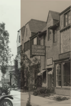
Businesses on Larchmont Boulevard