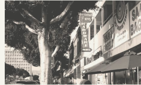
Color modified photograph of Larchmont sidewalk by Wikimedia user Arspickles17 under Creative Commons license**

Mercantile features generously-sized storefronts and shallow 60-foot bay depths. It spans over more than 17,000 square feet of commercial space, with storefronts that range in size from 993 to 1,311 square feet. The Larchmont Mercantile offers signage and secured rear entrances for each retail store, as well as a spacious parking lot inclusive of ~60 parking spaces* with valet assist and an entrance just adjacent.