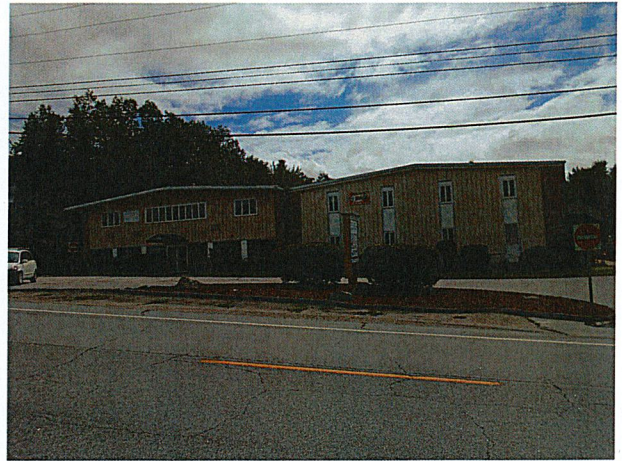
( https://images.vgsi.com/photos/HooksettNHPhotos/\00\01\90\41.jpg )