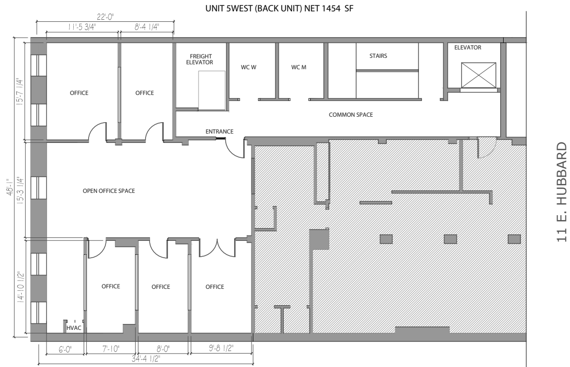
5B Floor Plan