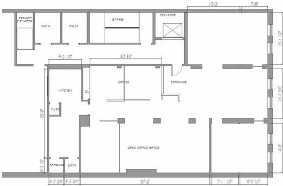
5A Floor Plan