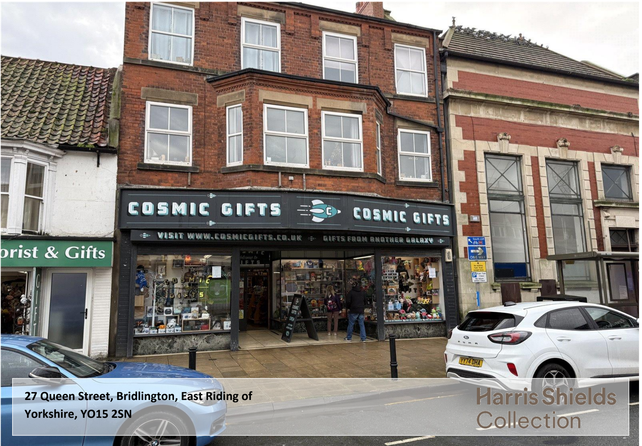
27 Queen Street, Bridlington, East Riding of Yorkshire, YO15 2SN