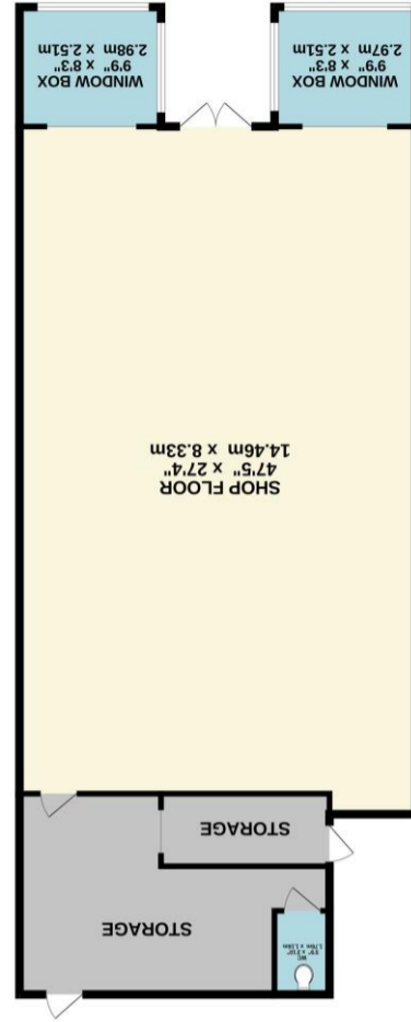
GROUND FLOOR 1723 sq ft (160.1 sq m.) approx.

We have every attempt to ensure the accuracy of the figures contained here, measurements of doors, windows, rooms and other items are approximate and no responsibility is taken for any omissions or misstatements. This plan is for information purposes only and should be used as such for any prospective purchaser. The services, systems and appliances shown have not been tested and no guarantee as to their operability or efficiency can be given.