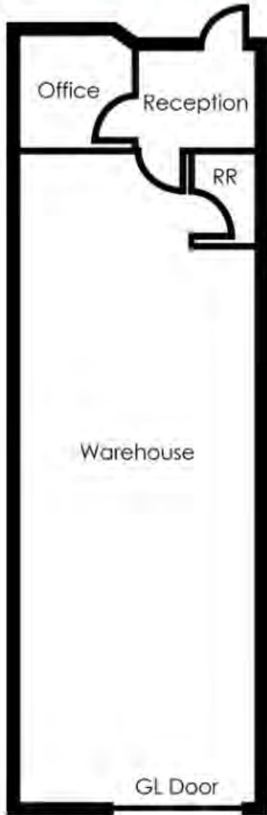
23342 S. POINTE DRIVE, UNIT I