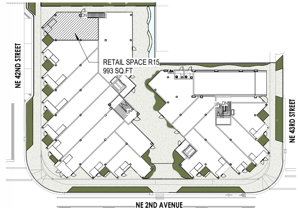
1 KEY PLAN SCALE: 1" = 50'-0"

THE INFORMATION PROVIDED ON THE LOD IS BASED ON INFORMATION FOUND IN THE BASE BUILDING (VENDOR PACKAGE) CORRESPONDENCE OR WORKING DRAWINGS AND MAY NOT REFLECT FINAL "ON-SITE AS IS" CONDITION NOR ALL CONDITIONS THAT MAY RESULT FROM ON SITE ADJUSTMENTS DURING CONSTRUCTION. THE LOD IS NOT INTENDED TO REFLECT EVERY CONDITION WITHIN THE SPACE WITH RESPECT TO STRUCTURE & MEP ONE OFF CONDITIONS. ADDITIONALLY, SCHEMATIC DESIGN DEVELOPMENT DRAWINGS ARE SUBJECT TO CHANGE AS THE PROJECT DOCUMENTS ARE FINALIZED. IT IS THE RESPONSIBILITY OF THE TENANT'S ARCHITECT AND CONTRACTOR TO FIELD VERIFY ALL INFORMATION PERTAINING TO THE PREMISES PRIOR TO COMMENCEMENT OF TENANT DRAWINGS & CONSTRUCTION.