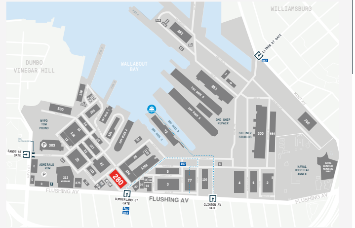
BLDG 280 LOCATION