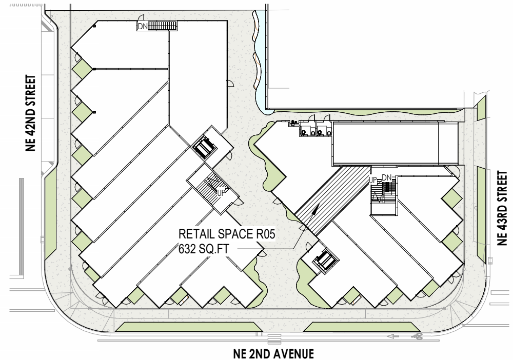
1 KEY PLAN SCALE: 1" = 50'-0"