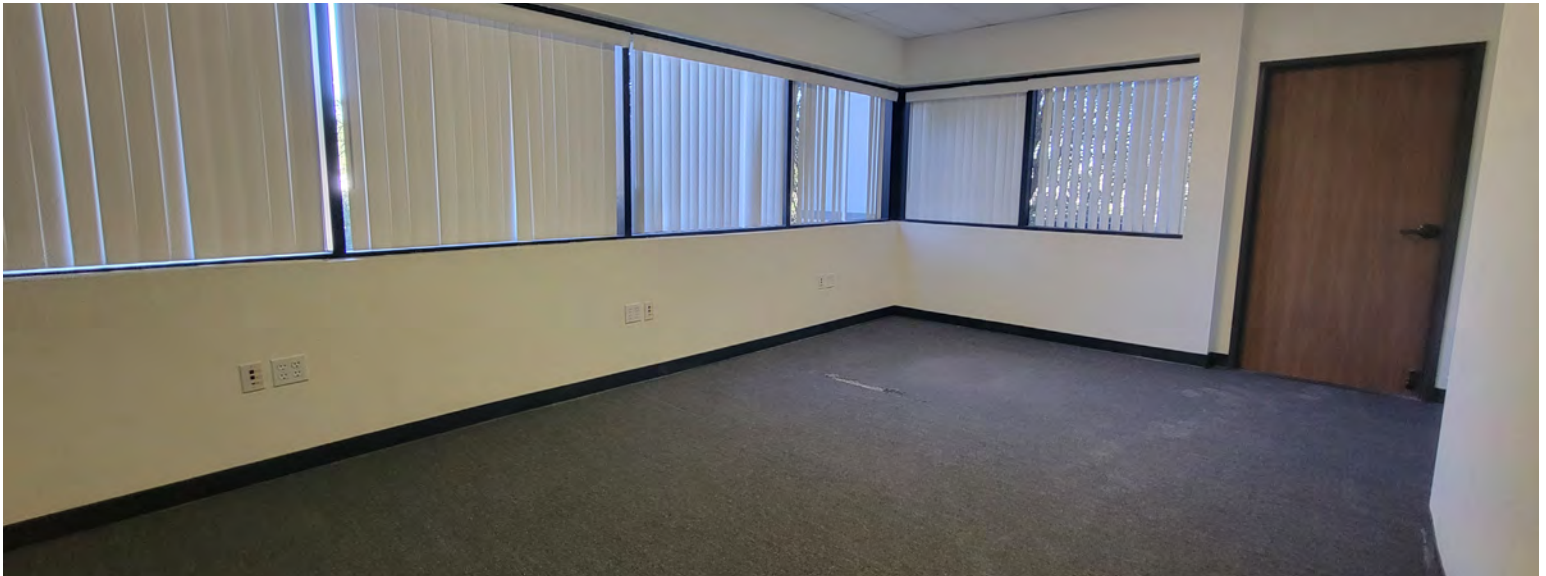
EXTRA LARGE OFFICE

JIM NADAL, CCIM 951.445.4520 jnadal@leetemecula.com DRE #01040679