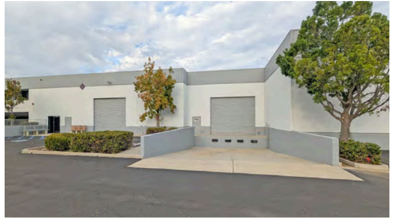
DOUBLE WIDE DOCK-HIGH LOADING