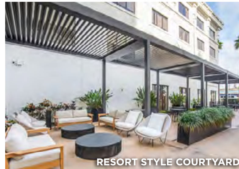
RESORT STYLE COURTYARD

Quick access to I-95 (2 miles) and Florida Turnpike (7 miles) for seamless connectivity