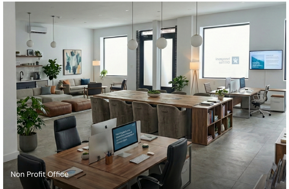
Non Profit Office