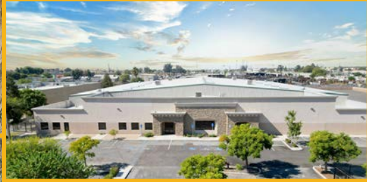
3401 North Sillect Avenue