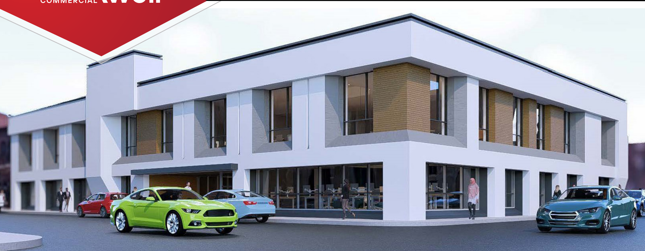
Conceptual Building Fascia Improvements