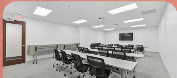
Tenant Conference & Training Center