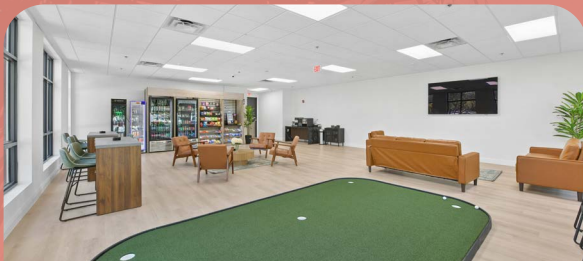
Tenant Lounge with Grab & Go Food