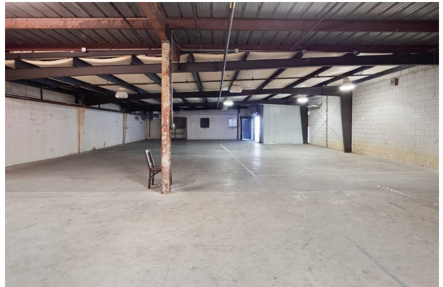
CANDLE FACTORY BUILDING 7521 RICHMOND RD., WILLIAMSBURG, VA