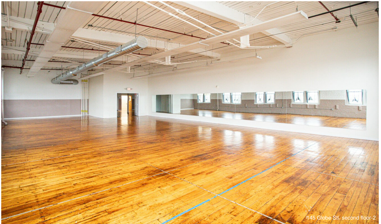
145 Globe Stl. second floor-2