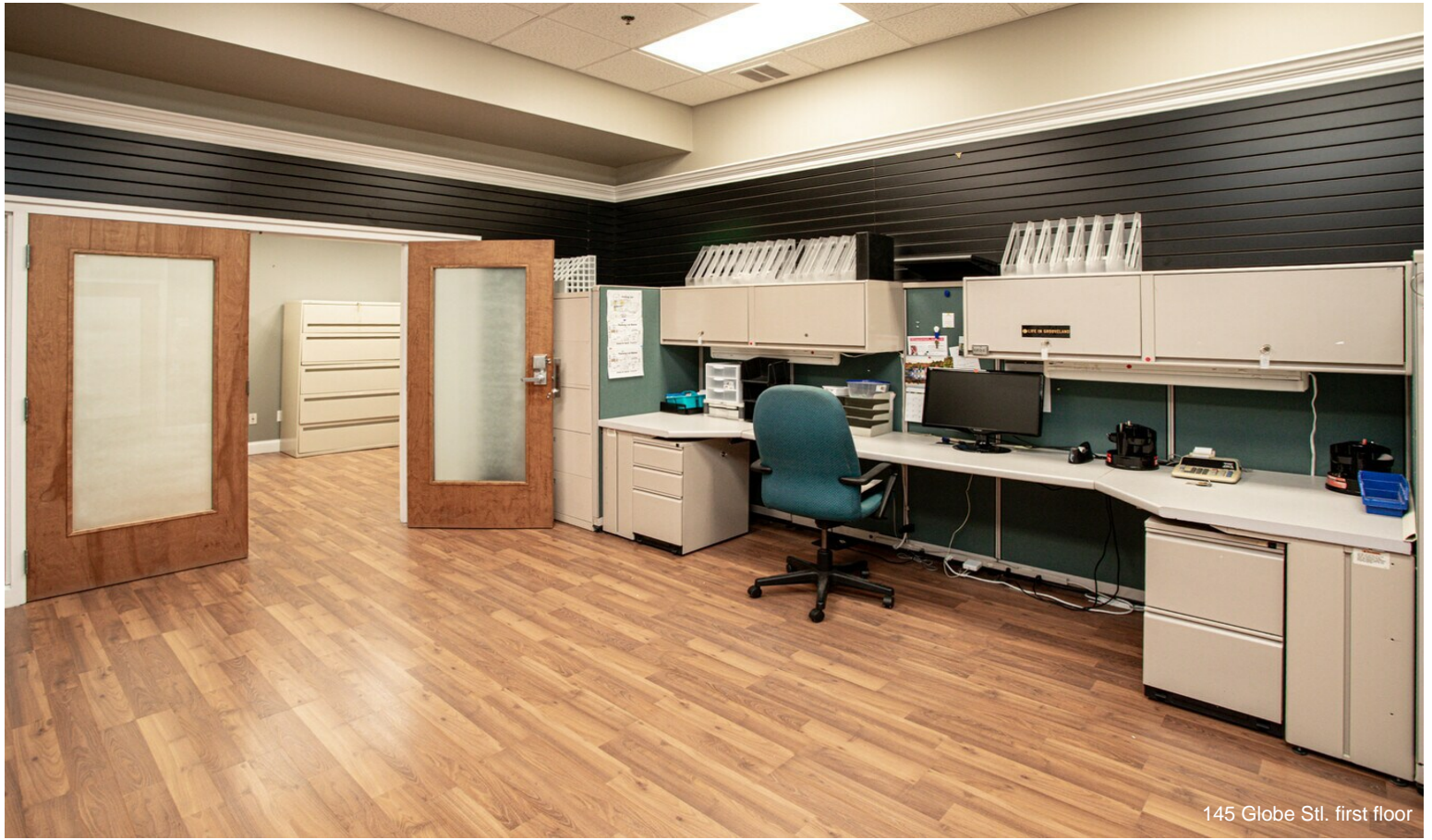
145 Globe Stl. first floor