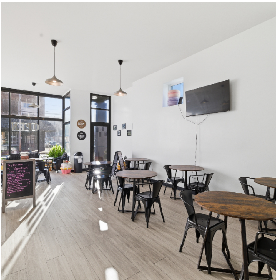
Cafe Dining Room