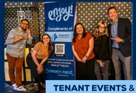
TENANT EVENTS & EXCLUSIVE PERKS