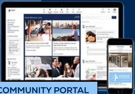
COMMUNITY PORTAL & TENANT APP