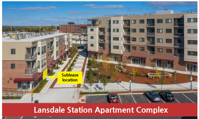
Lansdale Station Apartment Complex