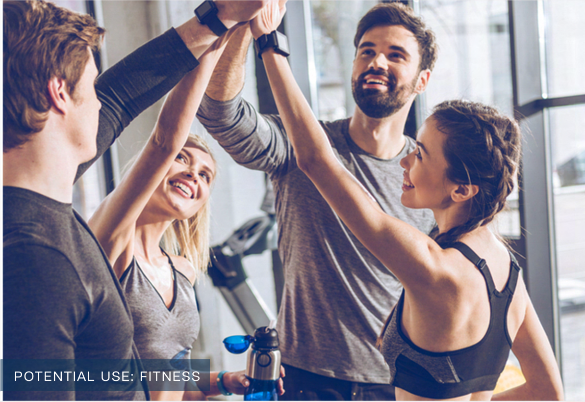
POTENTIAL USE: FITNESS