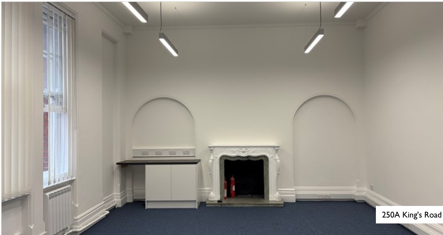
250A King's Road