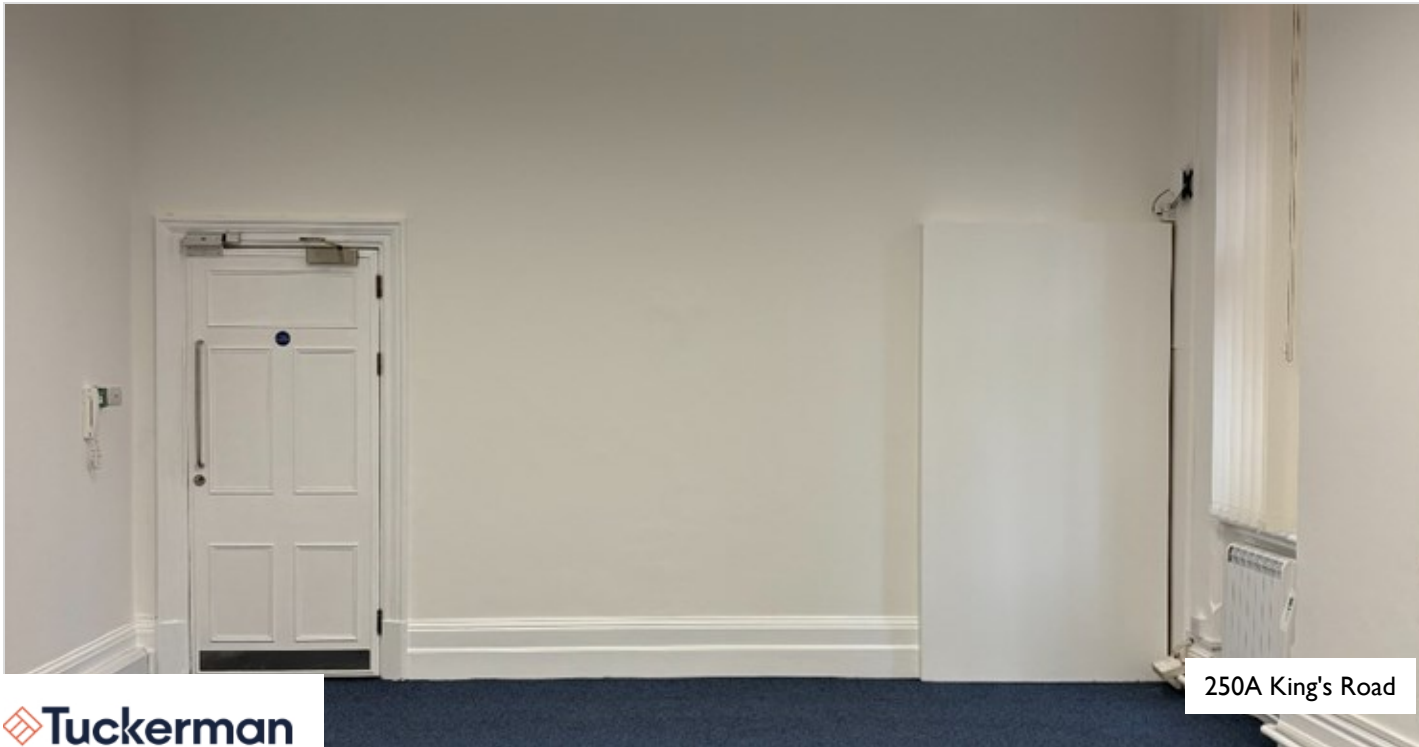
250A King's Road