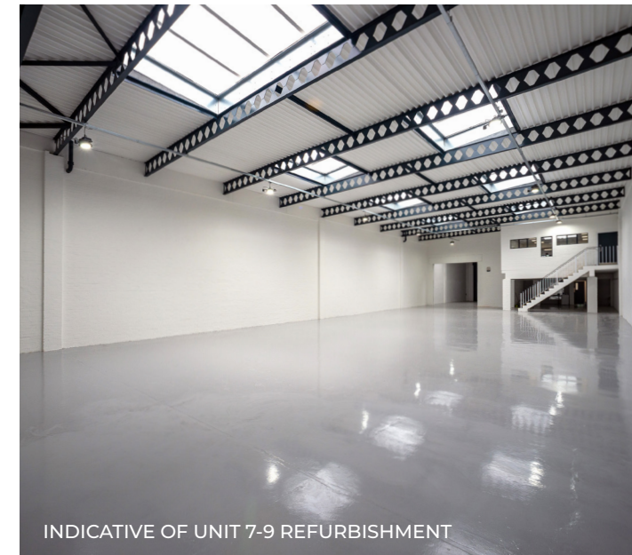
INDICATIVE OF UNIT 7-9 REFURBISHMENT