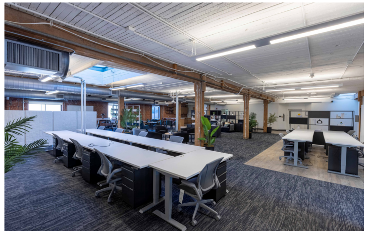
*Photos taken from 4 th floor spec build out