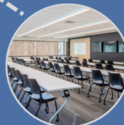
Conference center with configurable seating and established AV amenities

The information above has been obtained from sources believed reliable. While we do not doubt its accuracy, we have not verified it and make no guarantee, warranty or representation about it. It is the responsibility of all parties interested to independently confirm its accuracy and completeness. All parties may solicit their own advisor (s) to conduct a careful, independent investigation of the property to determine to your satisfaction the suitability of the property for your needs.