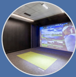
State-of-the-art golf simulator

Ferencroft Corporate Center is a suburban oasis where businesses thrive off urban-style convenience. From the 12.5 acres of beautiful grounds and sweeping views of the suburban landscape, after a $4 million re-investment to the full-service cafeteria, tenant lounge with state-of-the-art golf simulator and fitness center, Ferencroft is truly the best of both worlds.