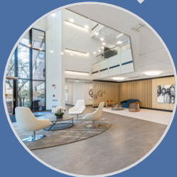
Lobby with high-end finishes