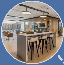
Full-service cafeteria and seating for 160 people