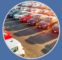
Extensive parking , including covered executive parking