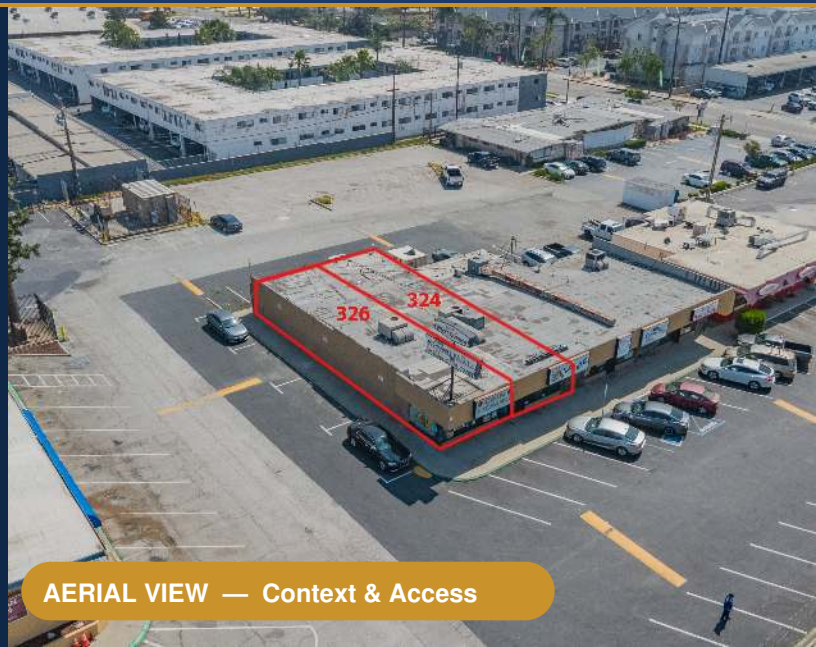
AERIAL VIEW — Context & Access