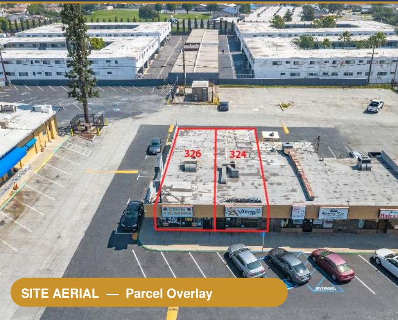
SITE AERIAL — Parcel Overlay

West Covina · N Azusa Ave Corridor · I-10 Freeway ±0.25 mi · 48K+ VPD