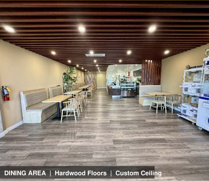
DINING AREA | Hardwood Floors | Custom Ceiling

Turnkey Buildout · Brand-New TI & FF&E · Strip Center · 100% Leased