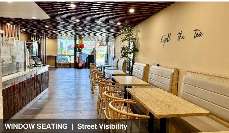
WINDOW SEATING | Street Visibility