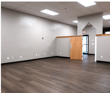
EXPANSIVE OPEN OFFICE