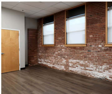
STUNNING RECEPTION/ WAITING AREA