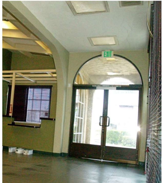
1201 E. 17 TH STREET ENTRY DOOR