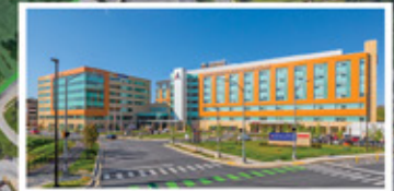
Adventist White Oak HealthCare Medical Center