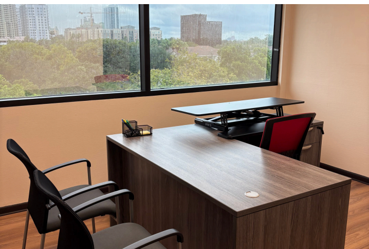
S U I T E 1 0 0