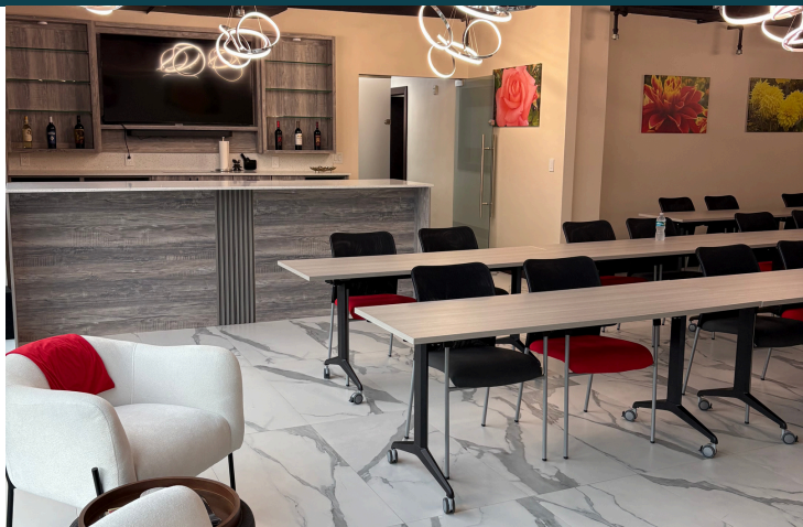
E V E N T S P A C E