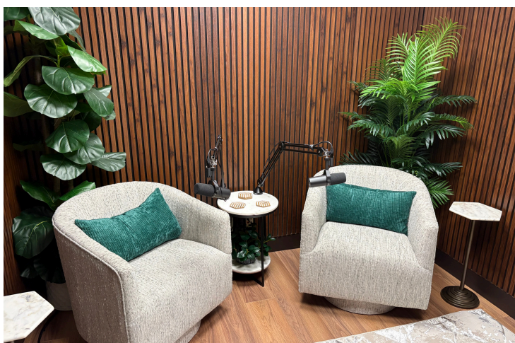
P O D C A S T