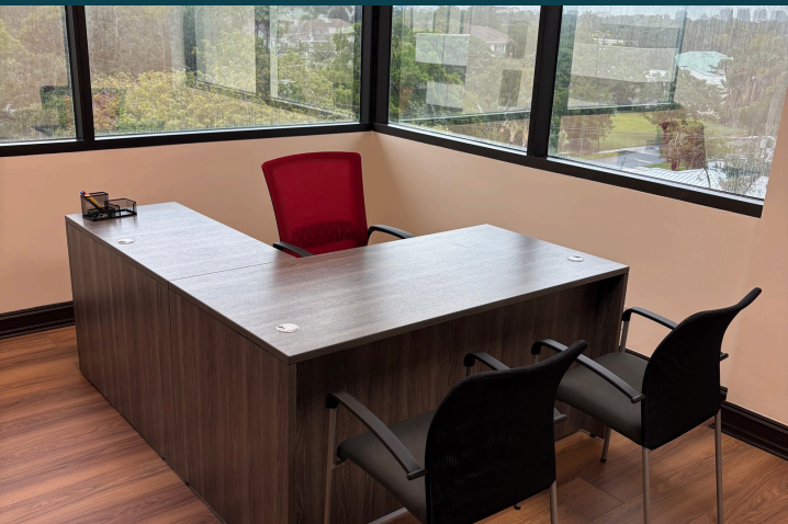
S U I T E 2 0 0

888 SE 3 rd Ave, Suite 502, Fort Lauderdale, FL 33316