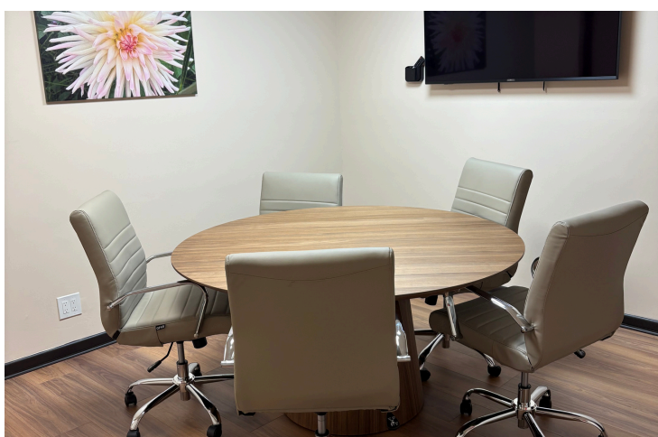
C O N F E R E N C E