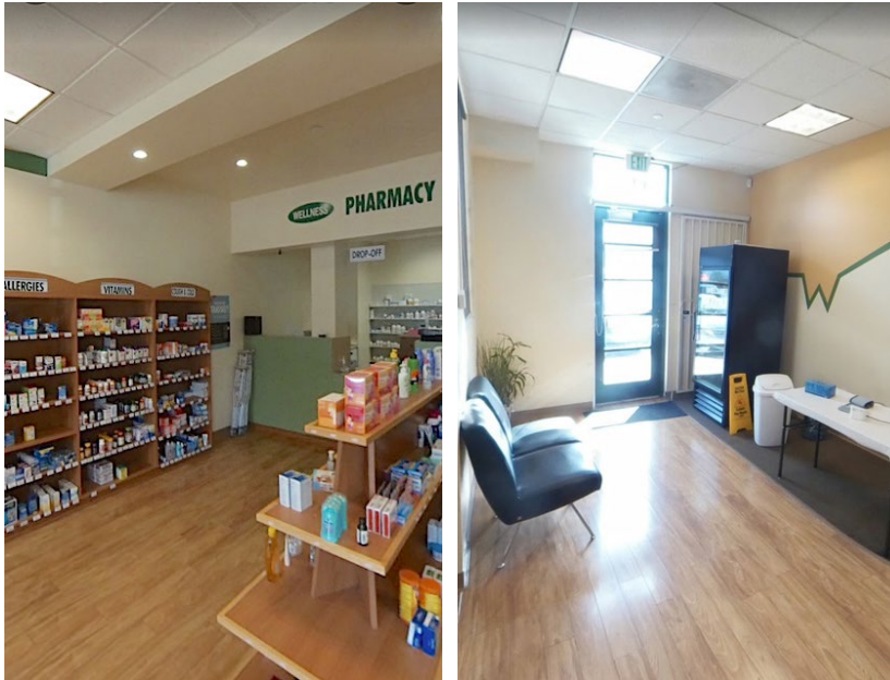
PREVIOUS INTERIOR PHOTOS