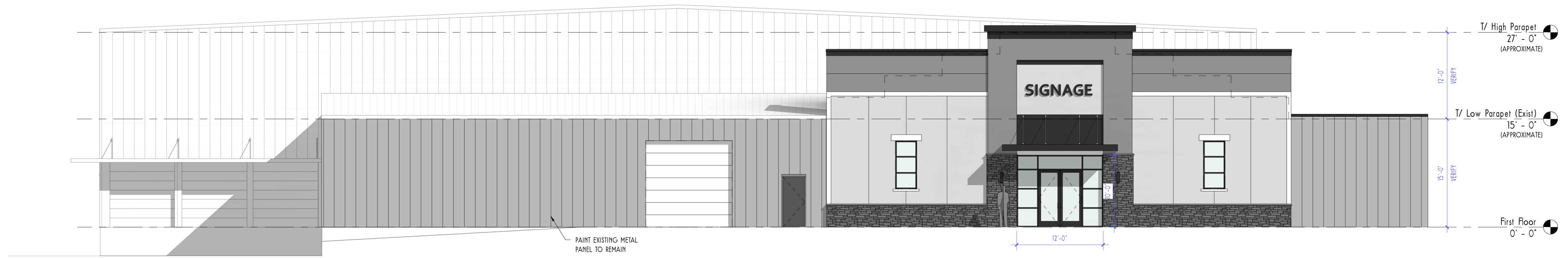
② Front Elevation 1/8" = 1'-0"