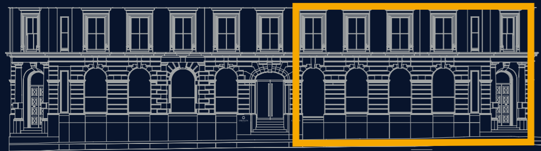
FRONT ELEVATION (SPRING GARDENS)