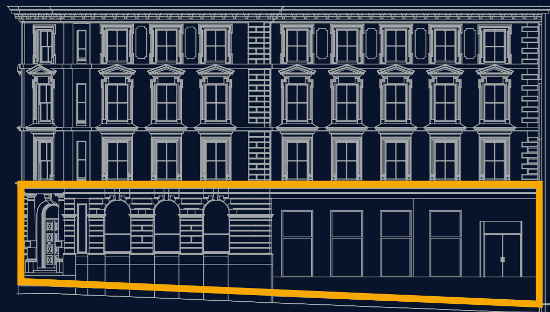
SIDE ELEVATION (FOUNTAIN ST)