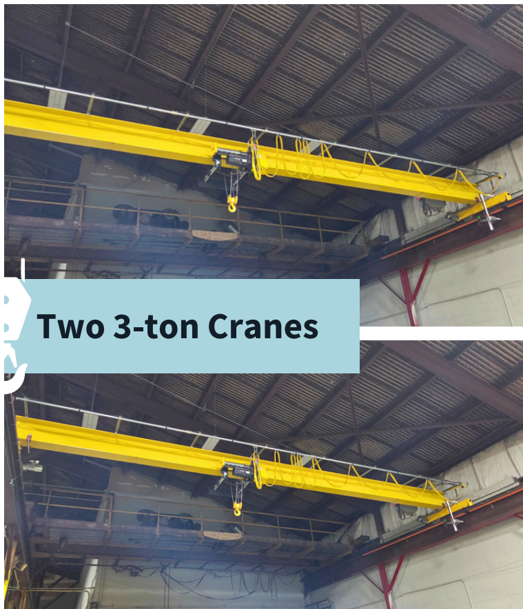
Two 3-ton Cranes