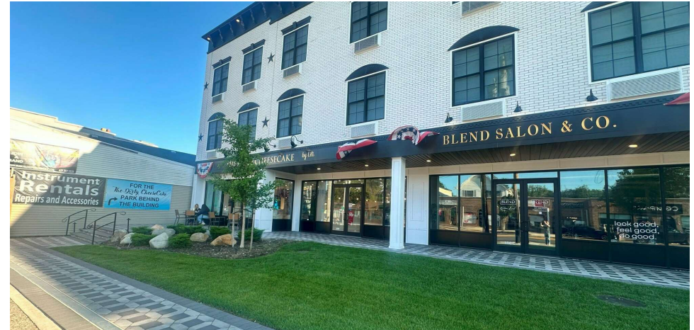
Meticulously Maintained Manicured Lawns and Exterior