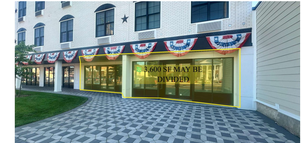
Expansive Windows Provide Striking Visibility and Prime Showcase Opportunities