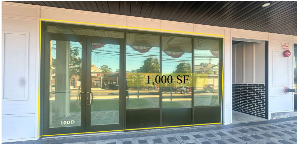
High-end Luxury Storefronts with Multiple Spaces Available for Lease