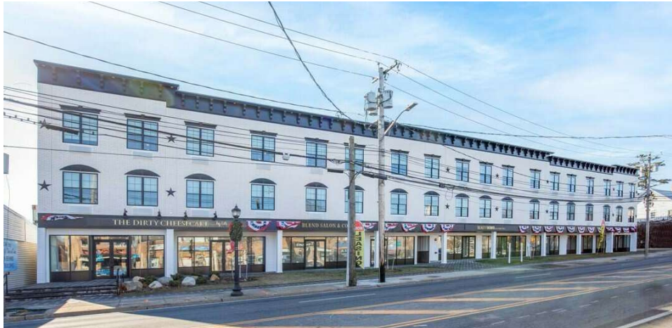
Tremendous Frontage and Visibility on Main Street

The Lofts at Maple & Main | 102 W Main St Smithtown, NY 11787